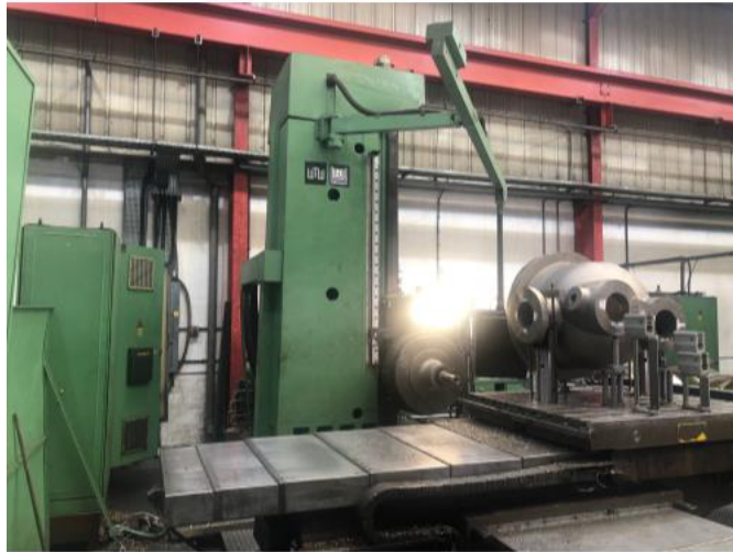
Photograph taken on site before machine has received any attention

UNION BFT110 NC 5 Axis CNC Horizontal Borer with Heidenhain TNC 355 Control. 110mm spindle diameter